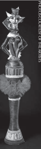
Above: "Notorious" by Suzy Birstein.